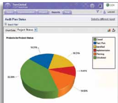
TeamCentral Illustration 2 — Graphical summary of audit plan status for current year audit plan, segmented by project status.